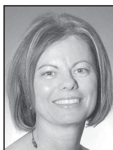
COMMUNITY PARTNER CHAIR