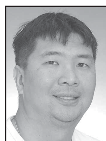
MAJOR INDUSTRY CHAIR